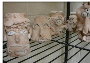
7th grade Face Jugs to be displayed at the Art Show.

Art Show & Grandparent's Day Our third Annual Art Show will be held in conjunction with Grandparents' and Grandfriends' Day. Now that we have the Armory, we can set up our Art Show and keep it open longer for our visitors. This year, we'll hold these events on the same day, May 13. Grandparent's and Grandfriends' Day will be held in the morning from 8:30 AM to Noon. The Armory will be open for tours in the morning. On the evening of May 13, the Art Gallery will reopen as our student docents provide tours to our families from 5:45 – 7:15 PM. Light refreshments will be served that evening. If you are new to the school, Grandparent's/Grandfriends' Day is a morning set aside for our students to invite their grandparents to the school. Visitors are welcome to attend a class, tour the campus, enjoy lunch with their grandchild, and visit the Art show. Grandparents will also have the opportunity to participate in a Living History Timeline coordinated by the Middle School Social Studies Department. The timeline will begin at 10 AM and last for approximately 30 minutes. If your grandparent is not available but you have a "grandfriend" in the community, please feel free to invite them to the school on May 13. Postcard invitations will be mailed in early April. Please make sure the Development Office has these "grand" addresses. Thanks!