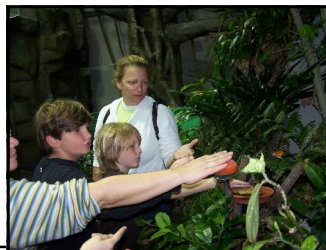
Placed-Based instruction places the students in the environment they are learning about.